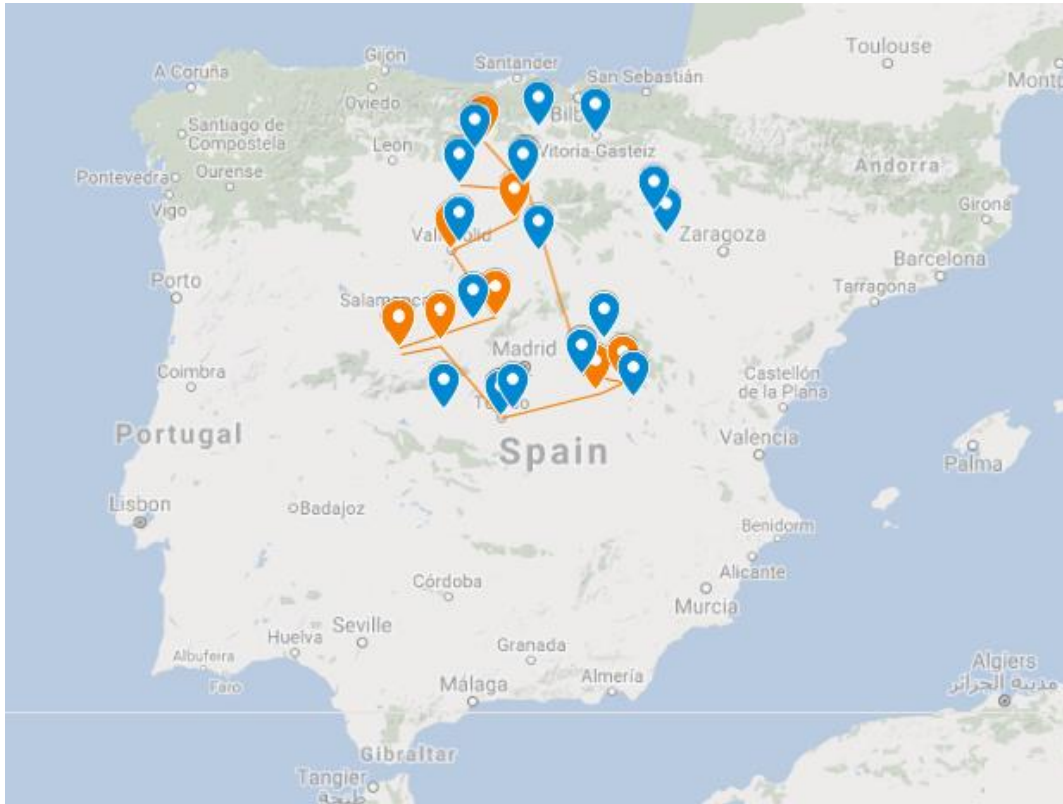
Figure 1. Diffusion of charter with dating clause concerning Fernando III's marriage and knighthood