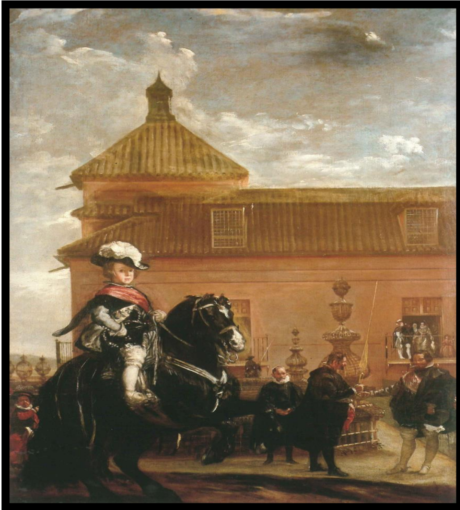
(fig. 4) Diego Velázquez & Workshop, Lección de equitación , 1636, Duke of Wellington's Collection, Londres.

The sculpture of Moon Diana plays two roles, it represents the age of the child; it also represents the Queen as ruler, the one who takes care of Carlos II and safeguards both the monarchy and the Crown. Moon Diana further references Mariana's role as a strong woman ( mujer fuerte ), one who possessed not only the traditional masculine virtue of fortitude, but also the