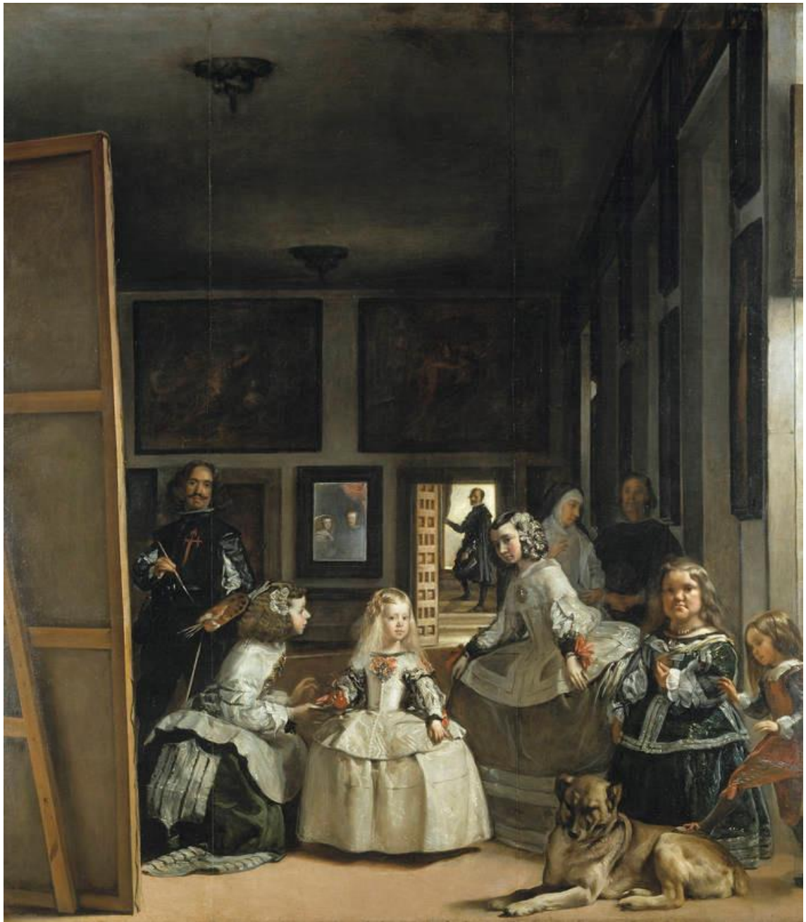
(fig. 1) Diego de Silva Velázquez, Las Meninas , 1656. Oil on canvas, 318 x 276 cm. Museo del Prado, Madrid (Spain).