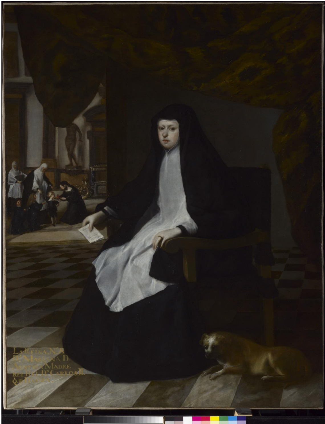
(fig. 2) Juan Bautista Martínez del Mazo, Queen Mariana of Spain in Mourning , 1666. Oil on canvas, 196.8 x 146 cm. National Gallery, London (United Kingdom).